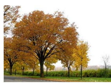
"Princeton" American Elm